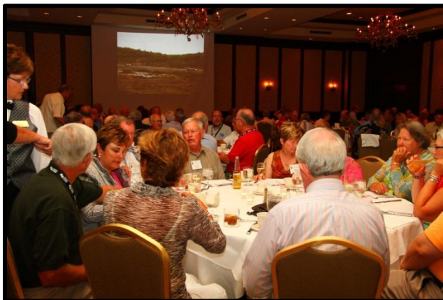
Record attendance as Preservation Society members and guest fill the Osthoff Conference Center.