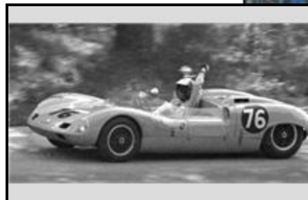
The 1963 Road America 500 winning Elva-Porsche Mk VII pictured below.