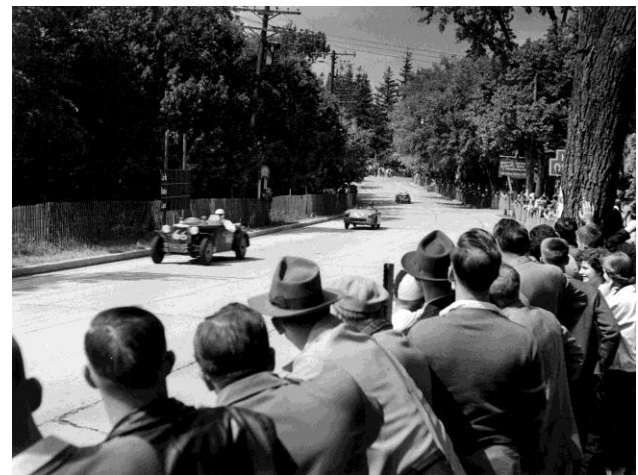
Norman Carlson's MG on South Lake Street in front of the original Osthoff Hotel in the 1952 Kimberly Cup Race. The location is now part of the Osthoff Walkway