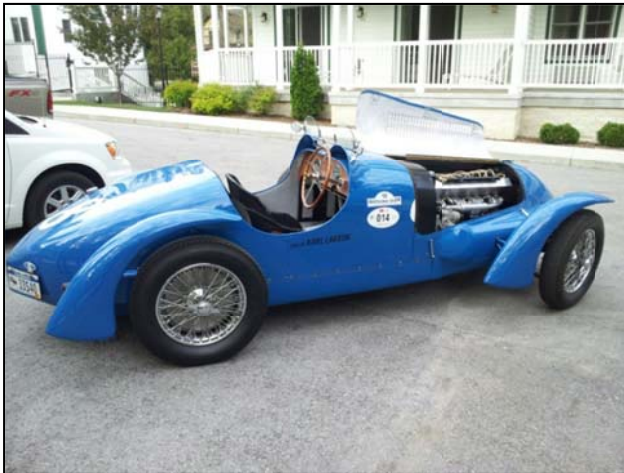
The 1937 Bugatti Type 57.